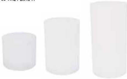
BT480 / BT481 / BT482 MOD CYLINDER PEDESTAL White 21"Dia.x18"H 21"Dia.x30"H 21"Dia.x42"H