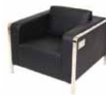
LG741 SURGE CHAIR Black, White w/USB 34"Wx34"Dx28"H