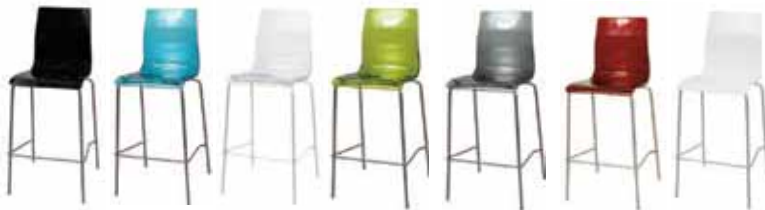
ST209 LIQUID STOOL Black, Blue, Clear, Green, Grey, Red, White 19"Wx20"Dx30"H