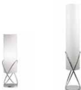
XT958 LINEN LAMP White/Chrome 7"Wx19"H