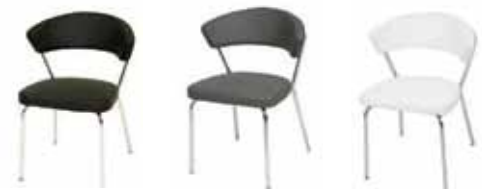
CH118 EURO CHAIR Black, Grey, White 22"Wx21"Dx18"H