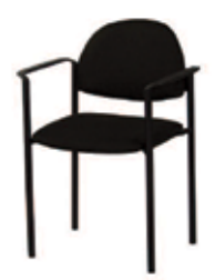
CO510 STACKABLE ARM CHAIR Black 24"Wx20"Dx18"H