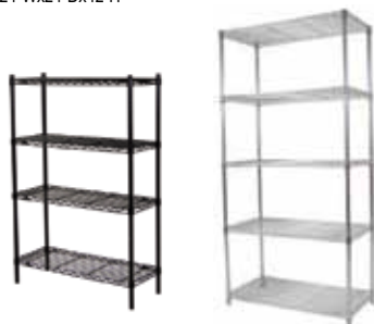
XT923/XT924 METAL SHELVING Black, Chrome 36"Wx14"Dx54"H or 36"Wx18"Dx72"H