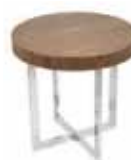
OT815 PALMA END TABLE Walnut, White 22 Dia.x22"H