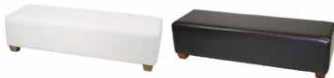
LG750 BENCH OTTOMAN Black, White 60"Wx20"Dx17"H