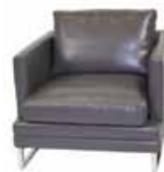
LG735 TRIBECA LEATHER CHAIR Grey 34"Wx36"Dx33"H