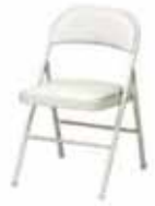
XT199 FOLDING CHAIR Black, Grey 19"Wx20"Dx18"H