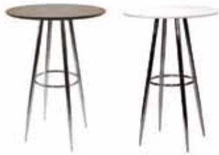
BT410 CHROMA BAR TABLE

Black, Natural, Walnut, White 30"Dia.x42"H