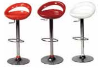
ST208 TICKLE STOOL Orange, Red, White - Adj. 19"Wx21"Dx23-31"H