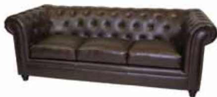
LG700 HAVANA SOFA Brown 93"Wx38"Dx34"H