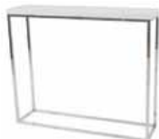
OT857 KLUB SOFA TABLE White 36"Wx10"Dx30"H