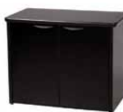
OF653 STORAGE CABINET Black, White - Locking 37"Wx20"Dx29"H