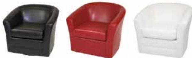
LG780 STEN SWIVEL CHAIR Black, Red, White 32"Wx32"Dx29"H