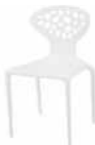
CH117 GENEVA CHAIR White 17"Wx19"Dx18"H