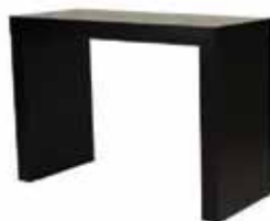
BT454 BALI BAR