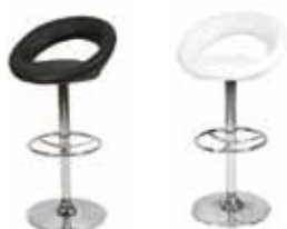
ST217 PLUTO STOOL Black, White 22"Wx18"Dx24-32"H