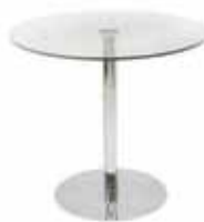
CT313 MARTINI TABLE Chrome/Glass 36"Dia.x30"H