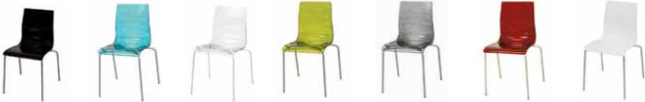
CH109 LIQUID CHAIR Black, Blue, Clear, Green, Grey, Red, White 20"Wx18"Dx18"H