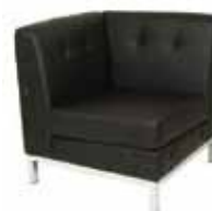
LG727 MADISON CORNER SECTIONAL Black, White 28"Wx28"Dx30"H