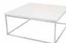
OT855 KLUB COCKTAIL TBL. White 36"Wx36"Dx15"H