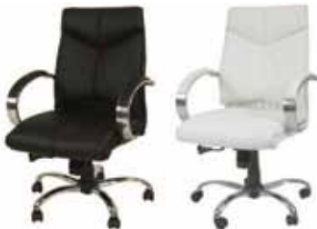
CO504 EXECUTIVE MIDBACK CHAIR Black, White 25"Wx24"Dx18-20"H