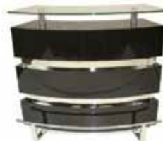
BT453 MILANO BAR