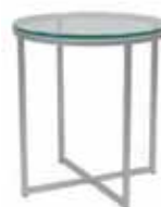
OT844 SPA END TABLE Silver/Glass 24"Dia.x24"H