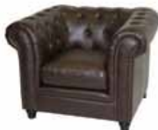
LG702 HAVANA CHAIR Brown 43"Wx38"Dx34"H