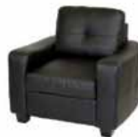
LG705 MADRID LEATHER CHAIR Black 40"Wx33"Dx34"H