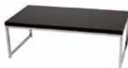
OT841 GIO COCKTAIL TABLE Black, Espresso 44"Wx22"Dx15"H