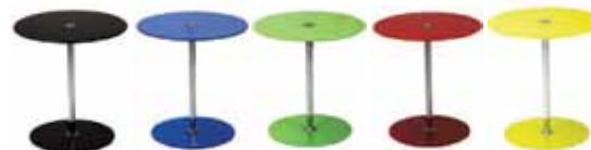
OT821 VEGA TABLE 18" DIA. Black, Blue, Green, Red, White, Yellow - Adjustable 18"Dia.x19-31"H