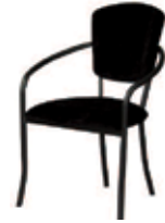
CH102 MONACO CHAIR Black 23"Wx23"Dx18"H