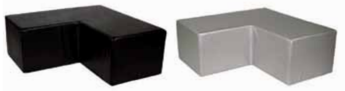
LG756 ANGLE OTTOMAN Black, Silver, White Leatherette 48"Wx48"Dx18"H