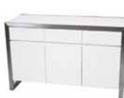
OF660 GLACIER SIDEBORD White-Gloss 48"Wx18"Dx30"H