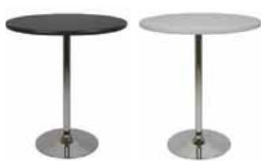
BT402 BAR HIGH TABLE

Black, White 24"Dia.x42"H or 30"Dia.x42"H