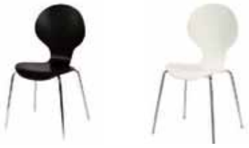
CH100 JACOBSON CHAIR Black, White 18"Wx17"Dx18"H