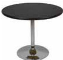
CT302 CAFE TABLE Black, Grey, White 36"Dia.x30"H