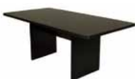
CF605 RECTANGULAR CONFERENCE TABLE Black, Cognac, Maple, White 72"Wx36"Dx30"H