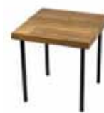
OT805 TUSCAN END TABLE Teak 18"Wx18"Dx18"H