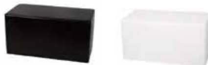
LG757 RECTANGLE OTTOMAN Black, Silver, White Leatherette 36"Wx18"Dx18"H