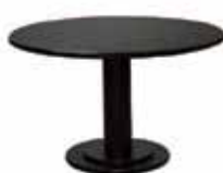
CF603 CONFERENCE TABLE Black, Cognac, Grey, Maple, White 48"Dia.x30"H