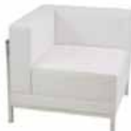
LG744-L MAUI CORNER White 28"Wx28"Dx27"H