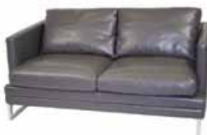
LG734 TRIBECA LEATHER LOVESEAT Grey 61"Wx36"Dx33"H