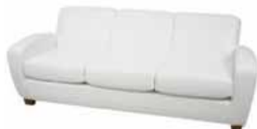
LG706 SCANDIC SOFA Black, Red, White 82"Wx34"Dx30"H