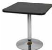
CT304 SQUARE CAFE TABLE Black, White 30"Sq.x30"H