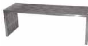
OT839 LINEAR COCKTAIL TABLE Steel 46"Wx15"Dx16"H