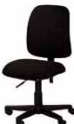
CO512 TASK CHAIR Black 19"Wx22"x18-22"H