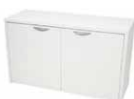
OF659 CREDENZA White 48"Wx18"Dx29"H