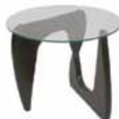
OT859 KAI END TABLE Black/Glass 26"Dia.x22"H