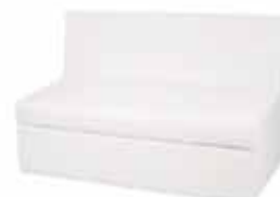
LG732 SOHO LOVESEAT White 48"Wx24"Dx31"H