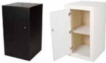
XT916 COMPUTER PEDESTAL Black, White - Locking 24"Wx24"Dx42"H