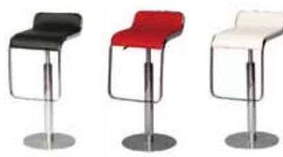
ST203 EQUINO STOOL Black, Red, White - Adj. 14"Wx17"Dx26-30"H