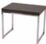
OT842 GIO END TABLE Black, Espresso 22"Wx16"Dx18"H