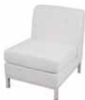
LG726 MADISON ARMLESS SECTIONAL Black, White 23"Wx28"Dx30"H