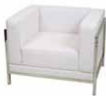
LG742 MAUI ARM CHAIR White 35"Wx29"Dx27"H