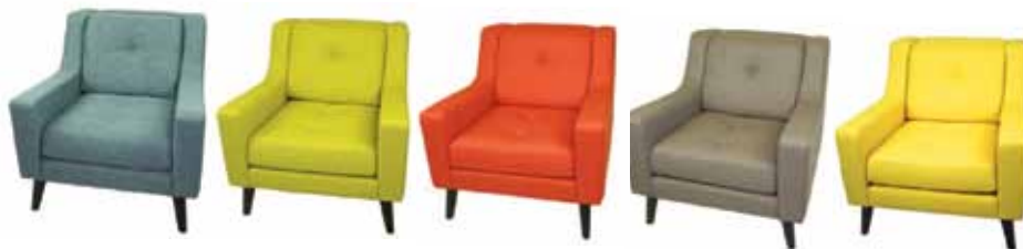
LG723 DANE CHAIR Blue, Green, Orange, Taupe, Yellow 34"Wx41"Dx34"H