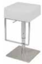
ST219 TECH STOOL White - Adjustable 15"Wx15"Dx22-29"H