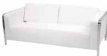
LG740 SURGE SOFA Black, White w/USB 72"Wx34"Dx28"H