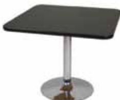
CT305 SQUARE CAFE TABLE Black, White 36"Sq.x30"H