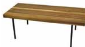
OT804 TUSCAN COCKTAIL TABLE Teak 48"Wx21"Dx16"H