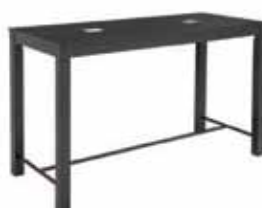
BT456 Spark Power Bar Table