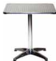
CT310 CHROMA TABLE Aluminum 27sq.x30"H