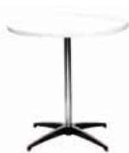
CT301 PEDESTAL TABLE Black, White 30"Dia.x30"H