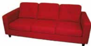
LG712 SOLO SOFA Black, Red 80"Wx35"Dx32"H