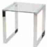
OT818 KEMI END TABLE Chrome/Glass 22"Wx22"Dx22"H