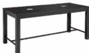
CT356 SPARK POWER TABLE 72"x30 Black, White 72"Wx30"Dx30"H