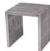
OT840 LINEAR END TABLE Steel 15"Wx15"Dx16"H