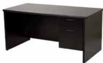
OF650 DESK TWO DRAWER Black - Locking 60"Wx30"Dx29"H