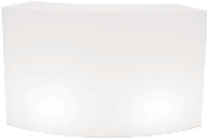
BT460 ITALIA CURVED BAR White, with light 65"Wx24"Dx40"H