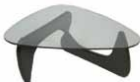
OT858 KAI COCKTAIL TABLE Black/Glass 36"Wx40"Dx15"H