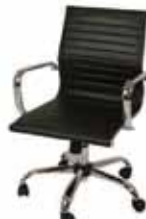
CO502 OTTO CHAIR Black, White 22"Wx24"Dx18-21"H