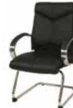
CO503 EXECUTIVE GUEST CHAIR Black, White 25"Wx24"Dx18"H