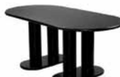
CF606 / CF608 CONFERENCE TABLE Black, Grey, White 72"Wx36"Dx30"H or 96"Wx42"Dx30"H