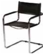
CH101 DELTA CHAIR Black 23"Wx22"Dx18"H