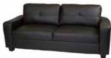
LG703 MADRID LEATHER SOFA Black 78"Wx33"Dx34"H