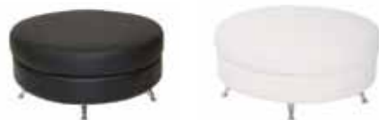
LG760 CAPRI OTTOMAN Black, White 40 Dia.x18"H