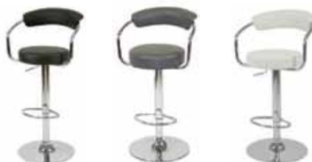
ST218 EURO STOOL Black, Grey, White - Adjustable 20"Wx17"Dx24-33"H