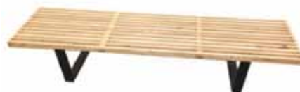
LG763 Java Bench Natural 72"Wx18"Dx15"H