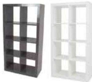
XT925 CUBE SHELF Grey, White 31"Wx15"Dx58"H