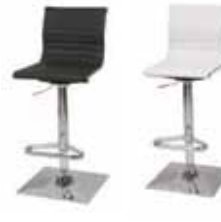
ST210 OTTO STOOL Black, White 16"Wx18"Dx24-30"H