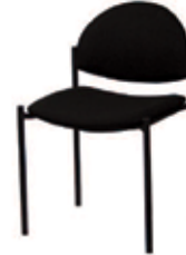
CO509 STACKABLE SIDE CHAIR Black 20"Wx20"Dx18"H