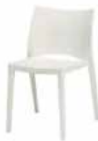
CH113 LESLIE CHAIR White 19"Wx21"Dx18"H