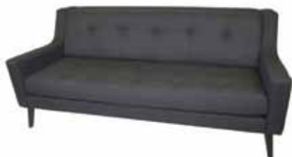
LG722 DANE SOFA Grey 80"Wx41"Dx34"H