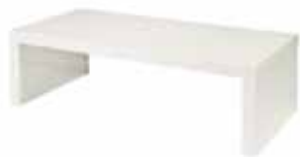
OT828 ABBY COCKTAIL TABLE Grey, White 48"Wx24"Dx14"H