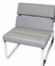
LG729 MIAMI CHAIR Grey, White 27"Wx31"Dx30"H