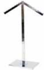
XT909 WATERFALL STAND Chrome - Adjustable 48"-72"H