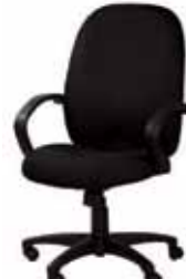
CO508 MIDBACK CHAIR Black 25"Wx24"Dx18-22"H