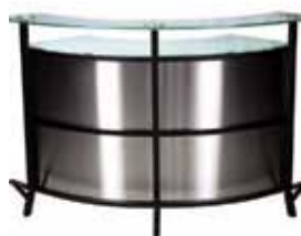
BT450 MANHATTAN BAR