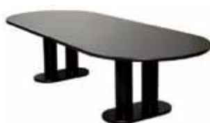
CF610 OVAL CONFERENCE TABLE Black, White 120"Wx42"Dx30"H