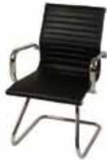
CO501 OTTO GUEST CHAIR Black, White 22"Wx24"Dx18"H