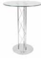
BT406 TRAVE BAR TABLE

Chrome/Glass 32"Dia.x42"H (Other sizes available)