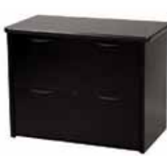
OF652 LATERAL FILE Black - Locking 36"Wx24"Dx29"H