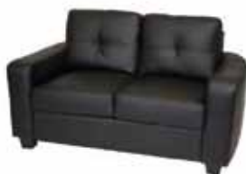
LG704 MADRID LEATHER LOVESEAT Black 62"Wx33"Dx34"H