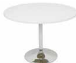
CT303 CAFE TABLE Black, Grey, White 42"Dia.x30"H