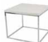
OT856 KLUB END TBL. White 24"Wx24"Dx18"H