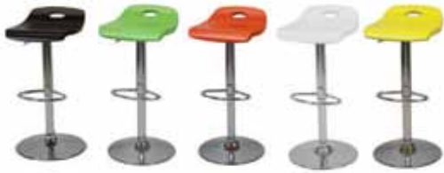
ST205 KOOL STOOL Black, Green, Orange, White, Yellow 16"Wx17"Dx26-30"H