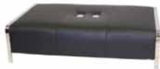
LG739 SURGE OTTOMAN Black, White w/USB 60"Wx39"Dx16"H