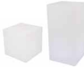
BT483 / BT484 MOD CUBE PEDESTAL White 24"Sq.x24"H 21"Sq.x42"H