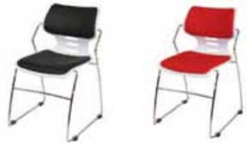
CH103 CAZMA CHAIR Black, Red 22"Wx22"Dx18"H