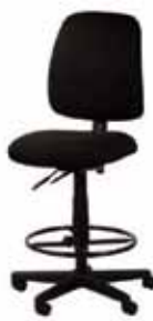
CO513 TASK STOOL Black, Adjustable 19"Wx22"Dx23-27"H