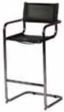
ST201 DELTA STOOL Black 20"Wx19"Dx28"H