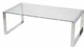
OT817 KEMI COCKTAIL TABLE Chrome/Glass 48"Wx24"Dx16"H