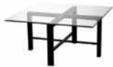
OT800 MONZA SQ. COCKTAIL TABLE Black 40"Wx40"Dx20"H