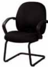
CO507 GUEST CHAIR Black 25"Wx25"Dx18"H