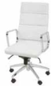
CO520 ZURICH HIGHBACK CHAIR White 26"Wx21"Dx18-22"H