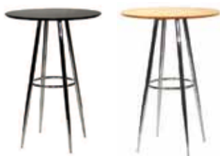
BT407 BRAVO BAR TABLE

Chrome/Glass 32"Dia.x42"H (Other sizes available)