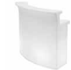
BT463 ITALIA DELUXE BAR White, with light 68"Wx24"Dx44"H