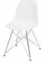
CH07 PARIS CHAIR White 19"Wx22"Dx18"H