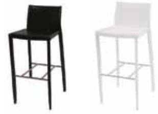
ST215 SHEN STOOL Black, White 17"Wx18"Dx30"H