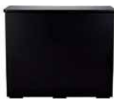
BT451 INFORMATION COUNTER