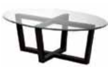
OT801 MONZA COCKTAIL TABLE Black 50"Wx32"Dx18"H