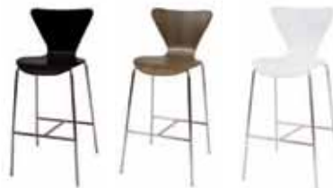
ST214 TENDY STOOL Black, Walnut, White 17"Wx17"Dx30"H