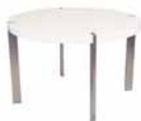
CF602 GLACIER CONFERENCE TABLE White-Gloss 47"Dia.x30"H