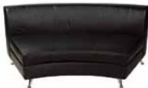
LG720 CAPRI SECTIONAL SOFA Black, White 71"Wx35"Dx30"H