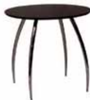
CT307 BISTRO TABLE Black, Natural, Walnut, White 30"Dia.x30"H