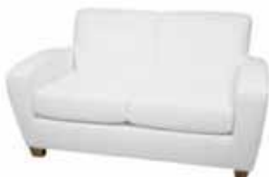
LG707 SCANDIC LOVESEAT Black, Red, White 59"Wx34"Dx30"H