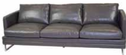
LG733 TRIBECA LEATHER SOFA Grey 89"Wx36"Dx33"H