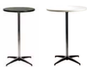
BT400 / BT401 BAR PEDESTAL TABLE

Black, White 24"Dia.x42"H or 30"Dia.x42"H