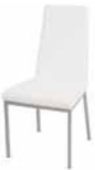
CH111 TICINO CHAIR White 18"Wx19"Dx18"H