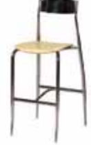
ST204 TOLEDO STOOL Natural/Chrome 19"Wx19"Dx30"H