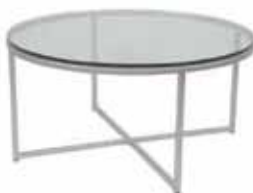
OT843 SPA COCKTAIL TABLE Silver/Glass 36"Dia.x18"H