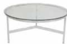
OT860 FIJI COCKTAIL TABLE Chrome/Glass 36"Dia.x17"H