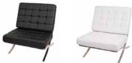
LG717 IBIZA CHAIR Black, White 30"Wx33"Dx33"H