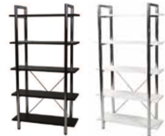
XT922 LAURENCE SHELF Black, White 35"Wx15"Dx72"H