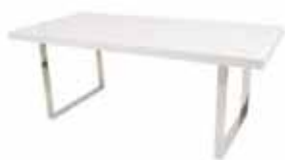
CF604 GLACIER CONFERENCE TABLE White-Gloss 79"Wx40"Dx30"H