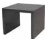
OT829 ABBY END TABLE Grey, White 24"Wx24"Dx20"H