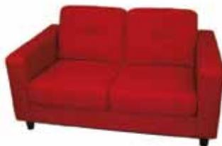
LG713 SOLO LOVESEAT Black, Red 57"Wx35"Dx32"H