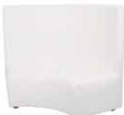
LG730 SOHO CURVED BANQUETTE White 60"Wx24"Dx48"H