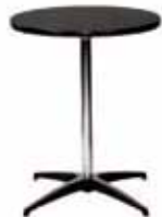
CT300 PEDESTAL TABLE Black, White 24"Dia.x30"H