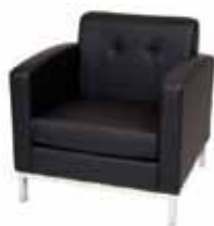
LG725 MADISON ARM CHAIR Black, White 28"Wx28"Dx30"H