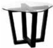
OT802 MONZA END TABLE Black 25"Wx25"Dx21"H