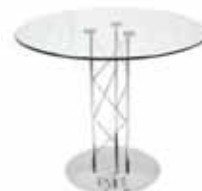
CT306 TRAVE TABLE Chrome/Glass 36"Dia.x30"H (Other sizes available)