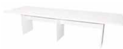
CF611 RECTANGULAR CONFERENCE TABLE Black, White 120"Wx42"Dx30"H

Additional conference table sizes, colors and power options available. Contact your sales rep for information.