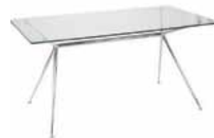
CT353 ALTOS TABLE Chrome/Glass 60"Wx36"Dx30"H