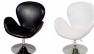
LG786 SWAN CHAIR Black, White 29"Wx28"Dx35"H