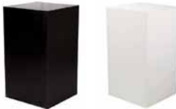
XT919 CUBE PEDESTAL Black, White 24"Wx24"Dx42"H