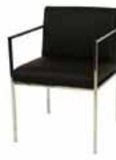
CO518 RECEPTION CHAIR Black 21"Wx23"Dx18"H