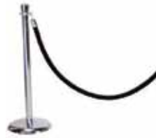
XT906 ROPE Black, Red 6'