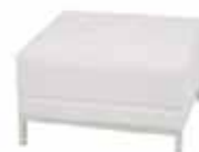
LG745 MAUI OTTOMAN White 28"Wx28"Dx17"H