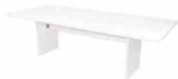
CF609 RECTANGULAR CONFERENCE TABLE Black, White 96"Wx42"Dx30"H