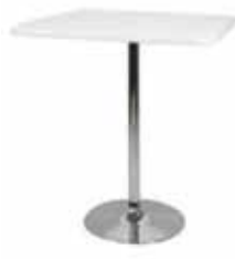
BT404 / BT405 SQUARE BAR TABLE