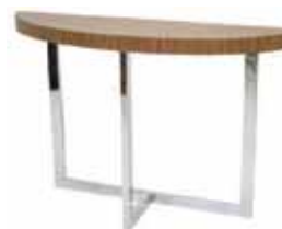
OT816 PALMA SOFA TABLE Walnut, White 47"Wx12"Dx32"H