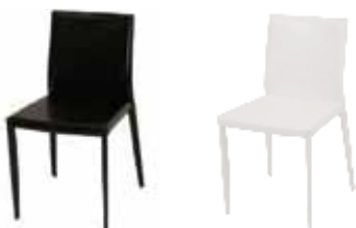
CH115 SHEN CHAIR Black, White 18"Wx20"Dx18"H