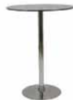
BT413 MARTINI BAR TABLE