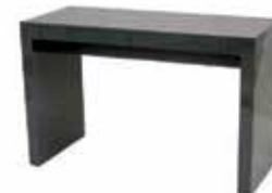
OF670 PARSON DESK Grey, White 48"Wx24"Dx29"H