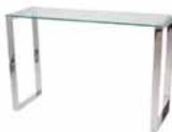
OT819 KEMI SOFA TABLE Chrome/Glass 48"Wx16"Dx31"H