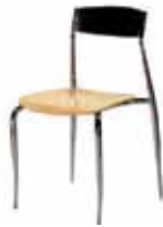
CH104 TOLEDO CHAIR Natural/Chrome 17"Wx19"Dx18"H