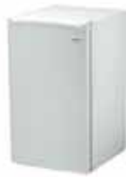
XT900 REFRIGERATOR 4.1 CF Black, White 19"Wx18"Dx32"H