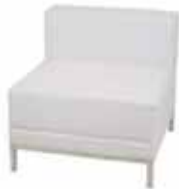
LG743 MAUI ARMLESS White 28"Wx28"Dx27"H