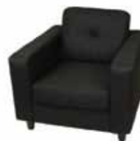
LG714 SOLO CHAIR Black, Red 34"Wx35"Dx32"H