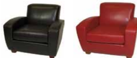
LG708 SCANDIC CHAIR Black, Red, White 38"Wx34"Dx30"H