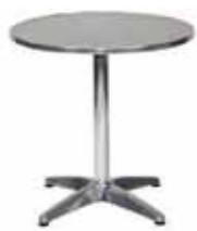
CT311 CHROMA TABLE Aluminum 27"Dia.x30"H