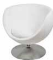
LG785 LARGO CHAIR White 30"Wx26"Dx28"H