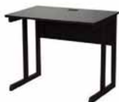
OF654 COMPUTER WORKSTATION Black 36"Wx24"Dx29"H