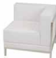
LG744-R MAUI CORNER White 28"Wx28"Dx27"H