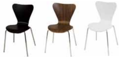
CH114 TENDY CHAIR Black, Walnut, White 17"Wx18"Dx18"H