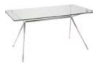
CT353 ALTOS TABLE Chrome/Glass 60"Wx36"Dx30"H