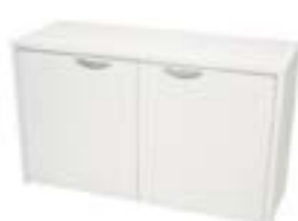
OF659 CREDENZA White 48"Wx18"Dx29"H