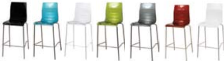
ST209 LIQUID STOOL Black, Blue, Clear, Green, Grey, Red, White 19"Wx20"Dx30"H