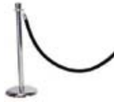
XT906 ROPE Black, Red 6'