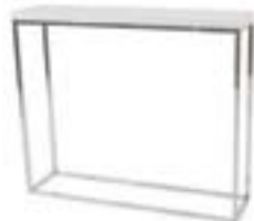
OT857 KLUB SOFA TABLE White 36"Wx10"Dx30"H