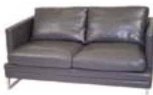
LG734 TRIBECA LEATHER LOVESEAT