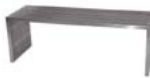
OT839 LINEAR COCKTAIL TABLE Steel 46"Wx15"Dx16"H