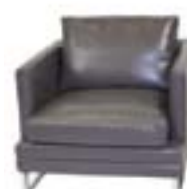
LG735 TRIBECA LEATHER CHAIR