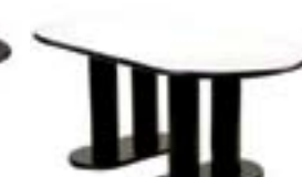
CF606 / CF608 CONFERENCE TABLE Black, Grey, White 72"Wx36"Dx30"H or 96"Wx42"Dx30"H