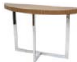
OT816 PALMA SOFA TABLE Walnut, White 47"Wx12"Dx32"H