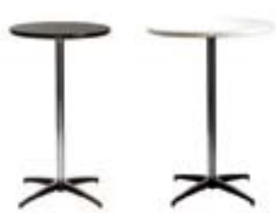
BT400 / BT401 BAR PEDESTAL TABLE

Black, White 24"Dia.x42"H or 30"Dia.x42"H