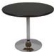
CT302 CAFE TABLE Black, Grey, White 36"Dia.x30"H