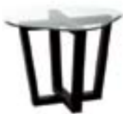
OT802 MONZA END TABLE Black 25"Wx25"Dx21"H