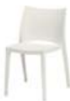
CH113 LESLIE CHAIR White 19"Wx21"Dx18"H