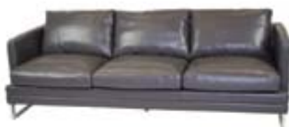
LG733 TRIBECA LEATHER SOFA