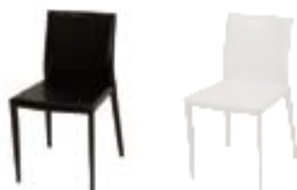
CH115 SHEN CHAIR Black, White 18"Wx20"Dx18"H