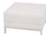
LG745 MAUI OTTOMAN White 28"Wx28"Dx17"H