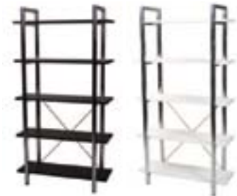
XT922 LAURENCE SHELF Black, White 35"Wx15"Dx72"H