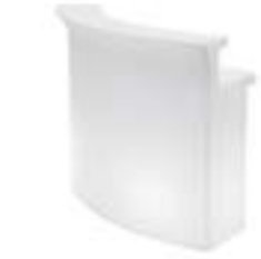
BT463 ITALIA DELUXE BAR White, with light 68"Wx24"Dx44"H