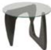
OT859 KAI END TABLE Black/Glass 26"Dia.x22"H