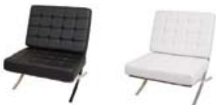
LG717 IBIZA CHAIR Black, White 30"Wx33"Dx33"H