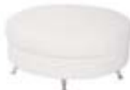
LG760 CAPRI OTTOMAN Black, White 40 Dia.x18"H