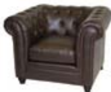
LG702 HAVANA CHAIR Brown 43"Wx38"Dx34"H