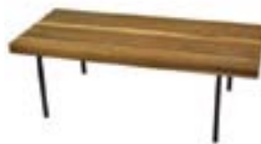
OT804 TUSCAN COCKTAIL TABLE Teak 48"Wx21"Dx16"H