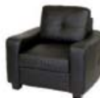
LG705 MADRID LEATHER CHAIR Black 40"Wx33"Dx34"H