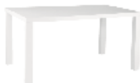
CT355 ABBY TABLE White 63"Wx36"Dx30"H