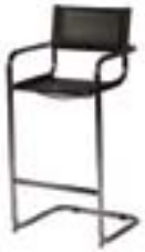
ST201 DELTA STOOL Black 20"Wx19"Dx28"H