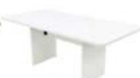
CF605 RECTANGULAR CONFERENCE TABLE Black, Cognac, Maple, White 72"Wx36"Dx30"H