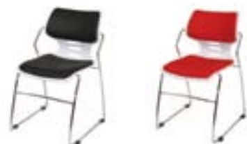
CH103 CAZMA CHAIR Black, Red 22"Wx22"Dx18"H