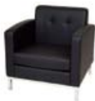
LG725 MADISON ARM CHAIR