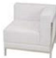
LG744-R MAUI CORNER White 28"Wx28"Dx27"H