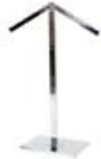
XT909 WATERFALL STAND Chrome - Adjustable 48"-72"H