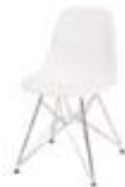
CH07 PARIS CHAIR White 19"Wx22"Dx18"H