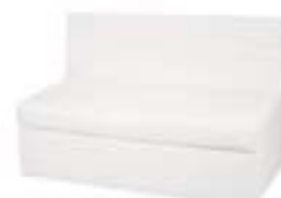
LG732 SOHO LOVESEAT