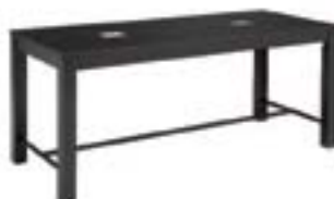
CT356 SPARK POWER TABLE 72"x30 Black, White 72"Wx30"Dx30"H