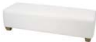
LG750 BENCH OTTOMAN Black, White 60"Wx20"Dx17"H