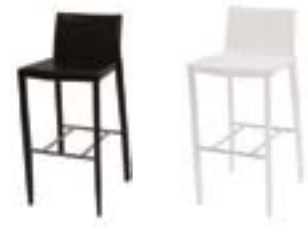
ST215 SHEN STOOL Black, White 17"Wx18"Dx30"H