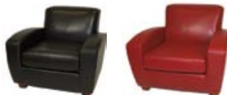
LG708 SCANDIC CHAIR Black, Red, White 38"Wx34"Dx30"H