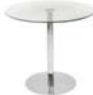
CT313 MARTINI TABLE Chrome/Glass 36"Dia.x30"H