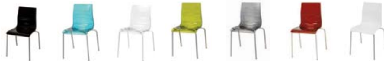
CH109 LIQUID CHAIR Black, Blue, Clear, Green, Grey, Red, White 20"Wx18"Dx18"H