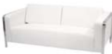
LG740 SURGE SOFA