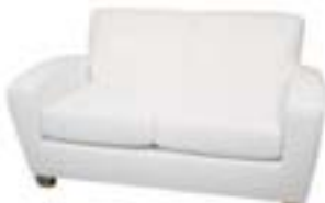
LG707 SCANDIC LOVESEAT Black, Red, White 59"Wx34"Dx30"H