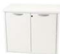
OF653 STORAGE CABINET Black, White - Locking 37"Wx20"Dx29"H