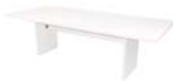
CF609 RECTANGULAR CONFERENCE TABLE Black, White 96"Wx42"Dx30"H