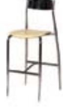
ST204 TOLEDO STOOL Natural/Chrome 19"Wx19"Dx30"H