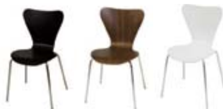
CH114 TENDY CHAIR Black, Walnut, White 17"Wx18"Dx18"H