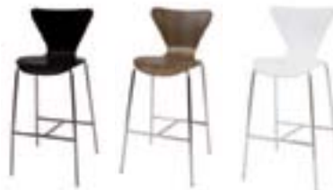
ST214 TENDY STOOL Black, Walnut, White 17"Wx17"Dx30"H