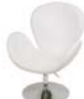
LG786 SWAN CHAIR Black, White 29"Wx28"Dx35"H