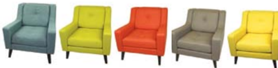
LG723 DANE CHAIR