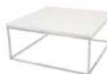
OT855 KLUB COCKTAIL TBL. White 36"Wx36"Dx15"H