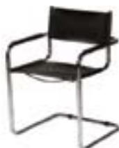
CH101 DELTA CHAIR Black 23"Wx22"Dx18"H