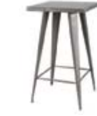
BT412 RETRO BAR TABLE