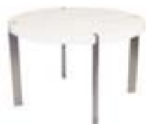
CF602 GLACIER CONFERENCE TABLE White-Gloss 47"Dia.x30"H