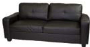
LG703 MADRID LEATHER SOFA Black 78"Wx33"Dx34"H