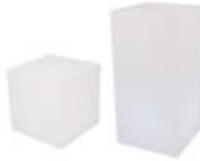
BT483 / BT484 MOD CUBE PEDESTAL White 24"Sq.x24"H 21"Sq.x42"H