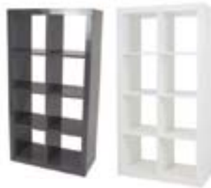
XT925 CUBE SHELF Grey, White 31"Wx15"Dx58"H