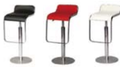
ST203 EQUINO STOOL Black, Red, White - Adj. 14"Wx17"Dx26-30"H