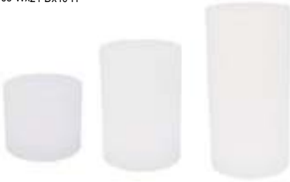
BT480 / BT481 / BT482 MOD CYLINDER PEDESTAL White 21"Dia.x18"H 21"Dia.x30"H 21"Dia.x42"H