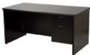
OF650 DESK TWO DRAWER Black - Locking 60"Wx30"Dx29"H