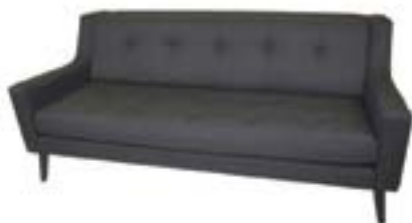
LG722 DANE SOFA