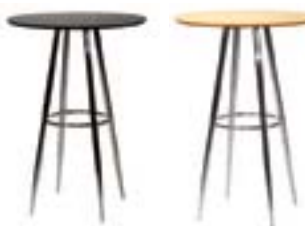
BT407 BRAVO BAR TABLE

Chrome/Glass 32"Dia.x42"H (Other sizes available)