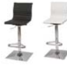
ST210 OTTO STOOL Black, White 16"Wx18"Dx24-30"H