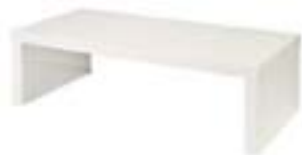
OT828 ABBY COCKTAIL TABLE Grey, White 48"Wx24"Dx14"H