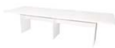
CF611 RECTANGULAR CONFERENCE TABLE Black, White 120"Wx42"Dx30"H

Additional conference table sizes, colors and power options available. Contact your sales rep for information.