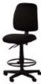
CO513 TASK STOOL Black, Adjustable 19"Wx22"Dx23-27"H