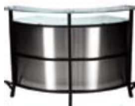
BT450 MANHATTAN BAR