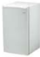
XT900 REFRIGERATOR 4.1 CF Black, White 19"Wx18"Dx32"H