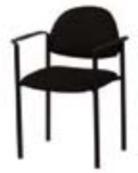
CO510 STACKABLE ARM CHAIR Black 24"Wx20"Dx18"H