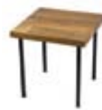
OT805 TUSCAN END TABLE Teak 18"Wx18"Dx18"H