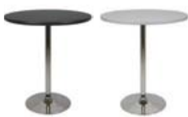
BT402 BAR HIGH TABLE

Black, White 24"Dia.x42"H or 30"Dia.x42"H