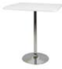
BT404 / BT405 SQUARE BAR TABLE