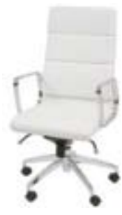
CO520 ZURICH HIGHBACK CHAIR White 26"Wx21"Dx18-22"H