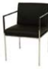
CO518 RECEPTION CHAIR Black 21"Wx23"Dx18"H