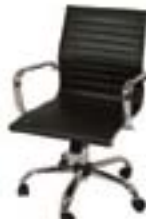
CO502 OTTO CHAIR Black, White 22"Wx24"Dx18-21"H