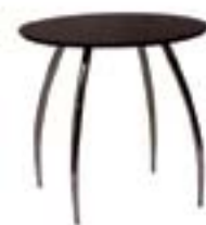
CT307 BISTRO TABLE Black, Natural, Walnut, White 30"Dia.x30"H