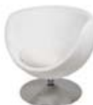
LG785 LARGO CHAIR White 30"Wx26"Dx28"H