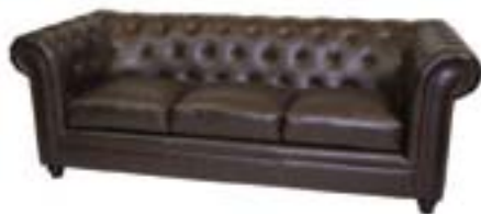
LG700 HAVANA SOFA Brown 93"Wx38"Dx34"H