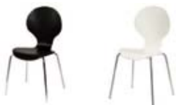
CH100 JACOBSON CHAIR Black, White 18"Wx17"Dx18"H