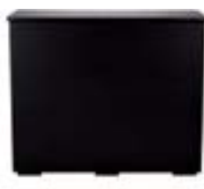
BT451 INFORMATION COUNTER