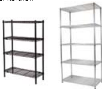
XT923/XT924 METAL SHELVING Black, Chrome 36"Wx14"Dx54"H or 36"Wx18"Dx72"H