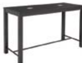
BT456 Spark Power Bar Table