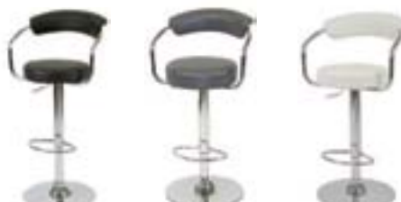
ST218 EURO STOOL Black, Grey, White - Adjustable 20"Wx17"Dx24-33"H