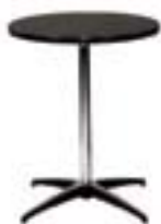
CT300 PEDESTAL TABLE Black, White 24"Dia.x30"H