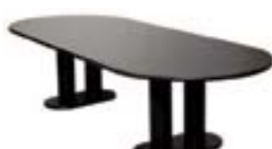
CF610 OVAL CONFERENCE TABLE Black, White 120"Wx42"Dx30"H