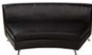
LG720 CAPRI SECTIONAL SOFA Black, White 71"Wx35"Dx30"H