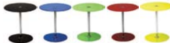
OT821 VEGA TABLE 18" DIA. Black, Blue, Green, Red, White, Yellow - Adjustable 18"Dia.x19-31"H