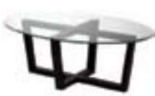
OT801 MONZA COCKTAIL TABLE Black 50"Wx32"Dx18"H