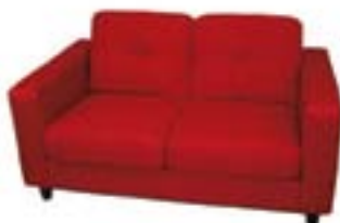
LG713 SOLO LOVESEAT Black, Red 57"Wx35"Dx32"H