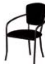
CH102 MONACO CHAIR Black 23"Wx23"Dx18"H