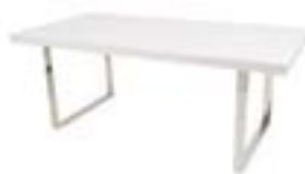
CF604 GLACIER CONFERENCE TABLE White-Gloss 79"Wx40"Dx30"H