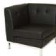
LG727 MADISON CORNER SECTIONAL