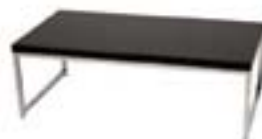
OT841 GIO COCKTAIL TABLE Black, Espresso 44"Wx22"Dx15"H