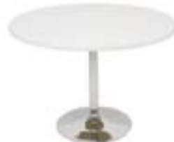
CT303 CAFE TABLE Black, Grey, White 42"Dia.x30"H