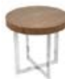
OT815 PALMA END TABLE Walnut, White 22 Dia.x22"H