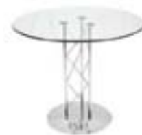
CT306 TRAVE TABLE Chrome/Glass 36"Dia.x30"H (Other sizes available)