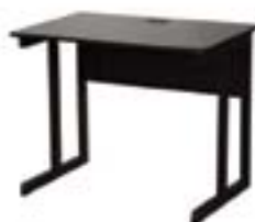
OF654 COMPUTER WORKSTATION Black 36"Wx24"Dx29"H