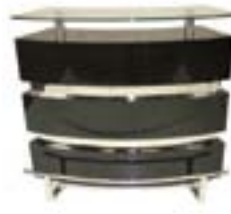
BT453 MILANO BAR