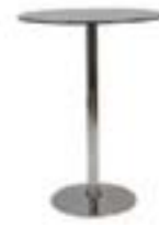
BT413 MARTINI BAR TABLE