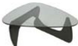
OT858 KAI COCKTAIL TABLE Black/Glass 36"Wx40"Dx15"H