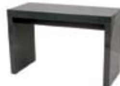
OF670 PARSON DESK Grey, White 48"Wx24"Dx29"H