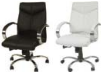
CO504 EXECUTIVE MIDBACK CHAIR Black, White 25"Wx24"Dx18-20"H