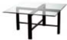
OT800 MONZA SQ. COCKTAIL TABLE Black 40"Wx40"Dx20"H