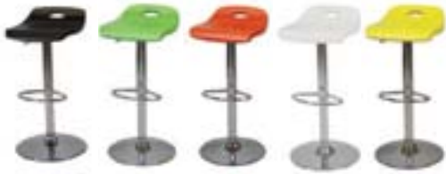
ST205 KOOL STOOL Black, Green, Orange, White, Yellow 16"Wx17"Dx26-30"H