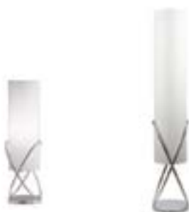
XT958 LINEN LAMP White/Chrome 7"Wx19"H