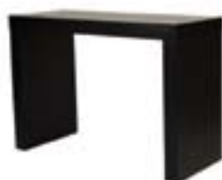
BT454 BALI BAR