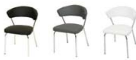
CH118 EURO CHAIR Black, Grey, White 22"Wx21"Dx18"H