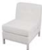
LG726 MADISON ARMLESS SECTIONAL