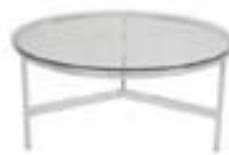
OT860 FIJI COCKTAIL TABLE Chrome/Glass 36"Dia.x17"H