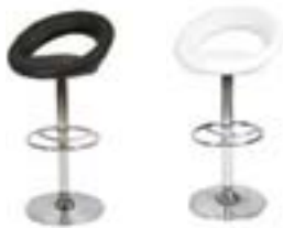
ST217 PLUTO STOOL Black, White 22"Wx18"Dx24-32"H