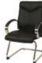
CO503 EXECUTIVE GUEST CHAIR Black, White 25"Wx24"Dx18"H