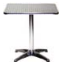
CT310 CHROMA TABLE Aluminum 27sq.x30"H