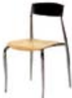
CH104 TOLEDO CHAIR Natural/Chrome 17"Wx19"Dx18"H