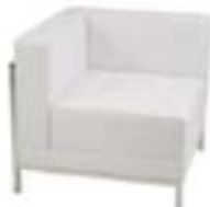
LG744-L MAUI CORNER White 28"Wx28"Dx27"H