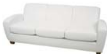
LG706 SCANDIC SOFA Black, Red, White 82"Wx34"Dx30"H