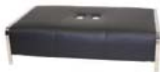
LG739 SURGE OTTOMAN