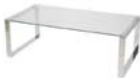
OT817 KEMI COCKTAIL TABLE Chrome/Glass 48"Wx24"Dx16"H