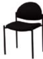
CO509 STACKABLE SIDE CHAIR Black 20"Wx20"Dx18"H