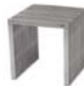
OT840 LINEAR END TABLE Steel 15"Wx15"Dx16"H