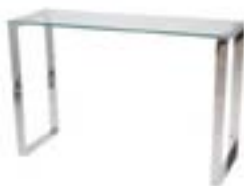
OT819 KEMI SOFA TABLE Chrome/Glass 48"Wx16"Dx31"H