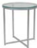
OT844 SPA END TABLE Silver/Glass 24"Dia.x24"H