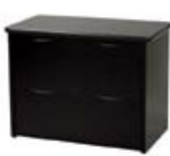
OF652 LATERAL FILE Black - Locking 36"Wx24"Dx29"H