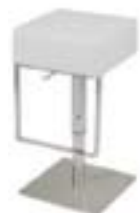
ST219 TECH STOOL White - Adjustable 15"Wx15"Dx22-29"H