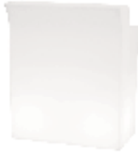
BT461 ITALIA BAR White, with light 36"Wx32"Dx43"H