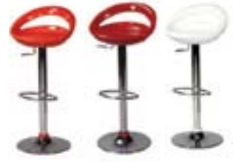
ST208 TICKLE STOOL Orange, Red, White - Adj. 19"Wx21"Dx23-31"H