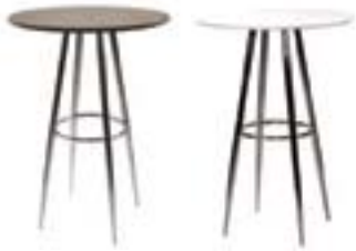
BT410 CHROMA BAR TABLE

Black, Natural, Walnut, White 30"Dia.x42"H