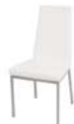
CH111 TICINO CHAIR White 18"Wx19"Dx18"H