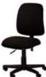
CO512 TASK CHAIR Black 19"Wx22"x18-22"H