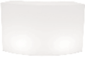
BT460 ITALIA CURVED BAR White, with light 65"Wx24"Dx40"H