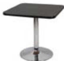
CT304 SQUARE CAFE TABLE Black, White 30"Sq.x30"H