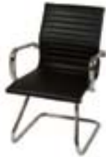
CO501 OTTO GUEST CHAIR Black, White 22"Wx24"Dx18"H