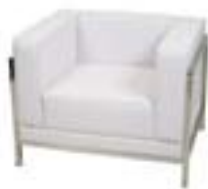
LG742 MAUI ARM CHAIR White 35"Wx29"Dx27"H