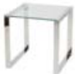
OT818 KEMI END TABLE Chrome/Glass 22"Wx22"Dx22"H