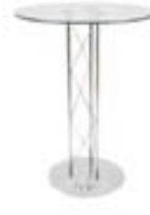
BT406 TRAVE BAR TABLE

Chrome/Glass 32"Dia.x42"H (Other sizes available)