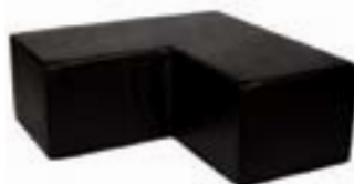
LG756 ANGLE OTTOMAN Black, Silver, White Leatherette 48"Wx48"Dx18"H