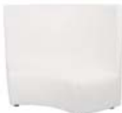
LG730 SOHO CURVED BANQUETTE