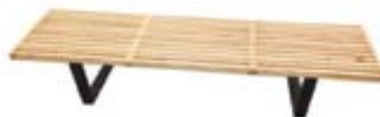
LG763 Java Bench Natural 72"Wx18"Dx15"H