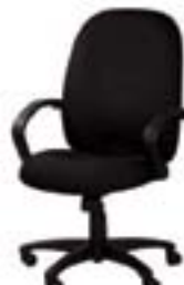
CO508 MIDBACK CHAIR Black 25"Wx24"Dx18-22"H