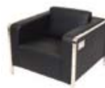
LG741 SURGE CHAIR