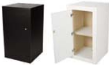
XT916 COMPUTER PEDESTAL Black, White - Locking 24"Wx24"Dx42"H