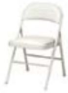
XT199 FOLDING CHAIR Black, Grey 19"Wx20"Dx18"H