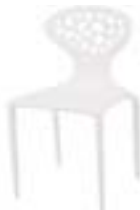
CH117 GENEVA CHAIR White 17"Wx19"Dx18"H