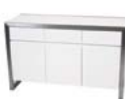
OF660 GLACIER SIDEBBOARD White-Gloss 48"Wx18"Dx30"H