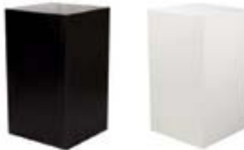
XT919 CUBE PEDESTAL Black, White 24"Wx24"Dx42"H