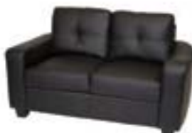
LG704 MADRID LEATHER LOVESEAT Black 62"Wx33"Dx34"H