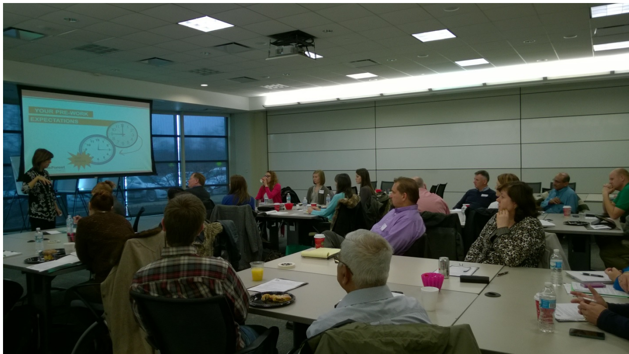
Dec 11, 2014 Professional Development Event – Paying close attention