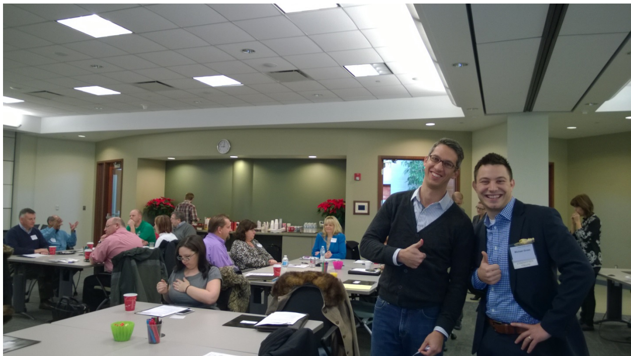
Dec 11, 2014 Professional Development Event - We are liking this!

Below are some pictures of the event for you to enjoy: