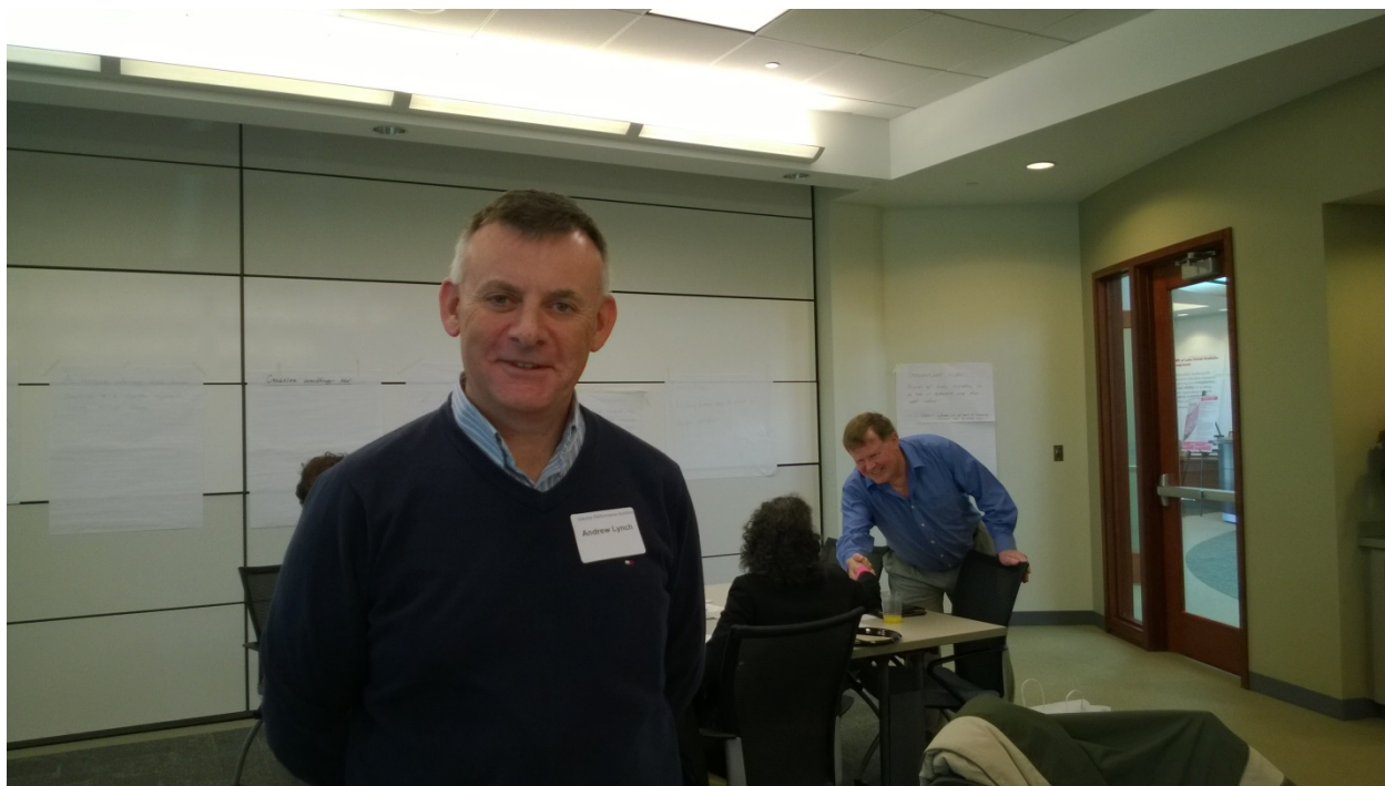
Dec 11, 2014 Professional Development Event – My team did good!