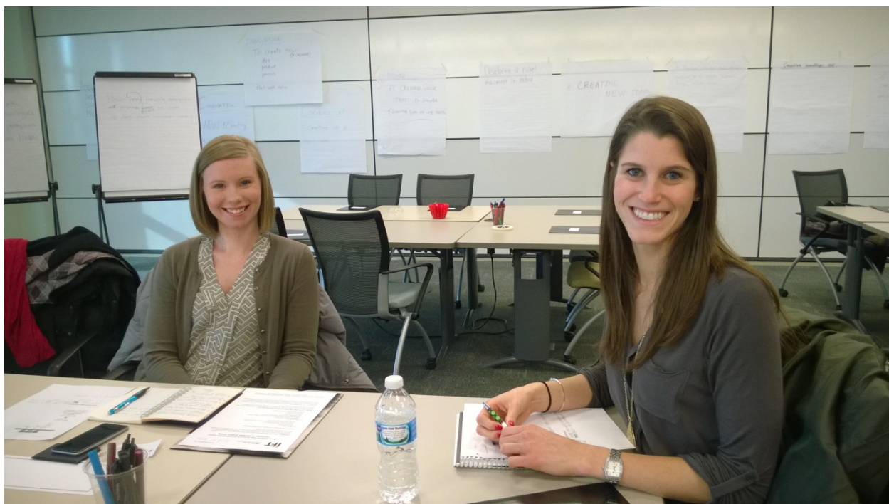
Dec 11, 2014 Professional Development Event – Our other two star performers!