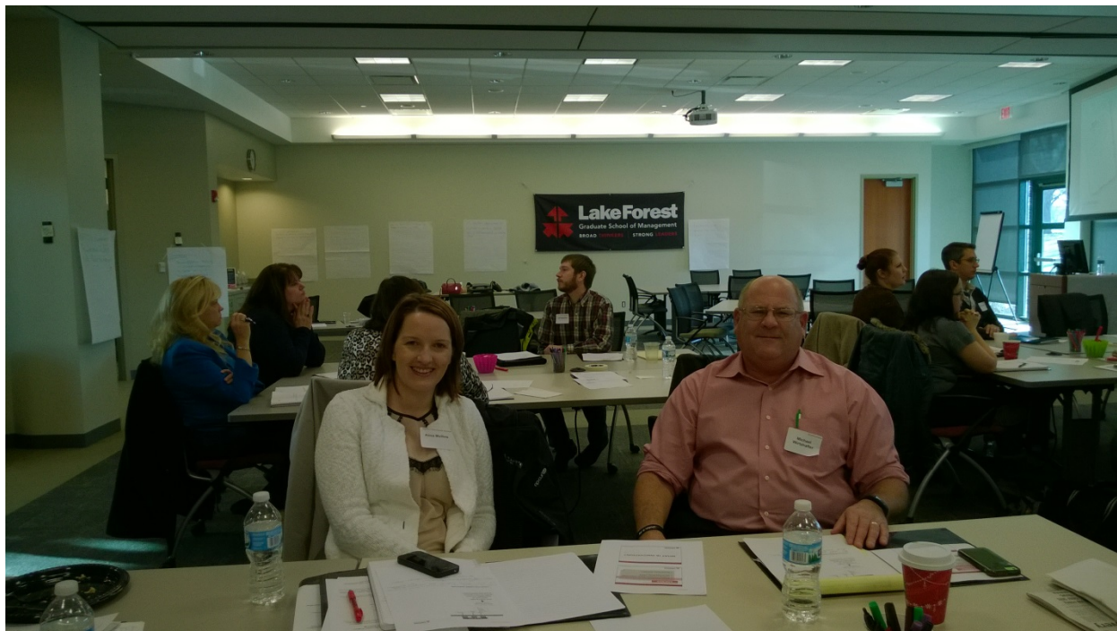
Dec 11, 2014 Professional Development Event – This was great!