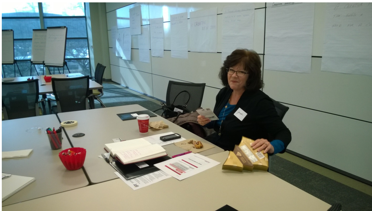
Dec 11, 2014 Professional Development Event – Another winner (she was special)!