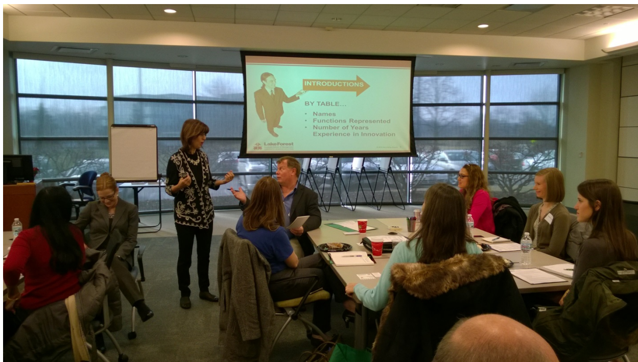
Dec 11, 2014 Professional Development Event – The teacher's favorite!