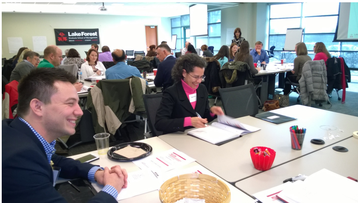
Dec 11, 2014 Professional Development Event – We are having fun!