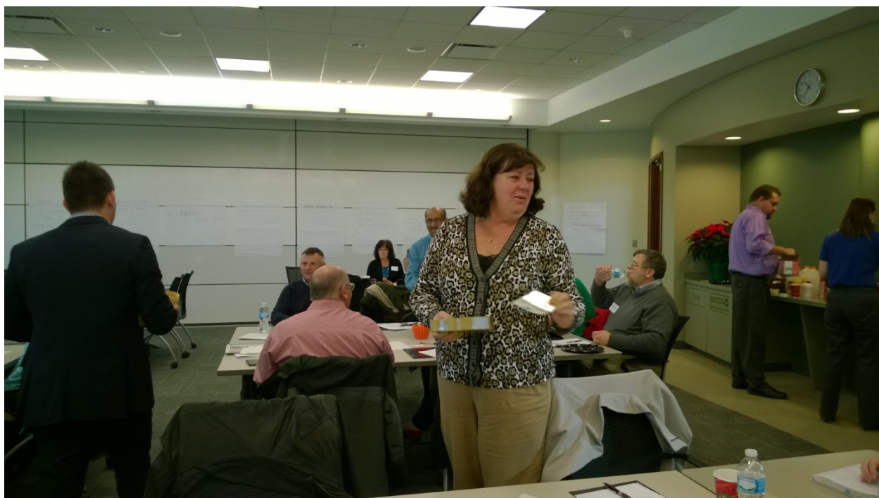
Dec 11, 2014 Professional Development Event – I won too!