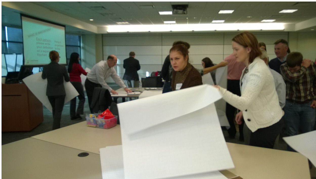
Dec 11, 2014 Professional Development Event – We need to win this!