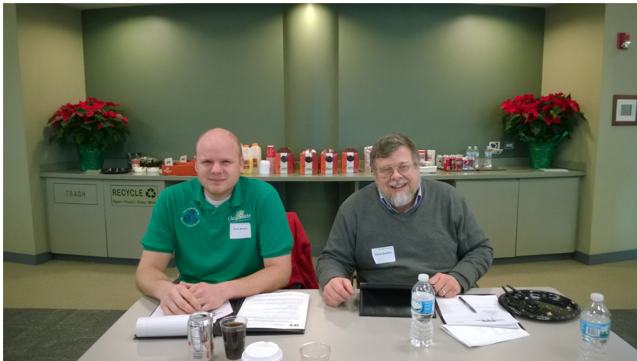
Dec 11, 2014 Professional Development Event – The Champions!