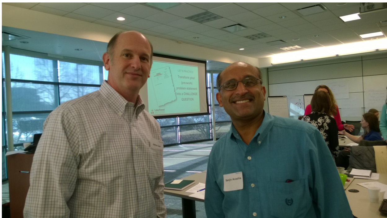
Dec 11, 2014 Professional Development Event – Our two star performers!